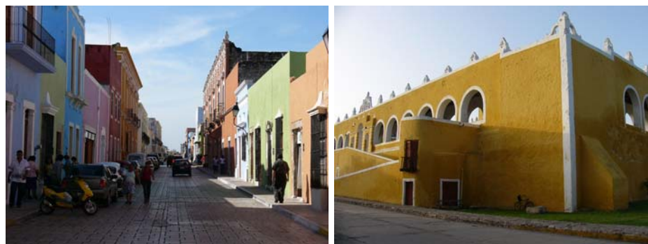
Top left: a decorated church. Above: the cities of Campeche and Izamal Below: A whale shark investigates the boat and welcomes you into the water

Special addition: We are currently working to secure an excursion to Rio Lagartos to view Sea turtles nesting on the beach at night. If this becomes available we will spend one less night on Isle Holbox. Day 8 will take us from Chichen Itza to Rio Lagartos where we will spend the evening there and view Pink Flamingos and Sea Turtles.